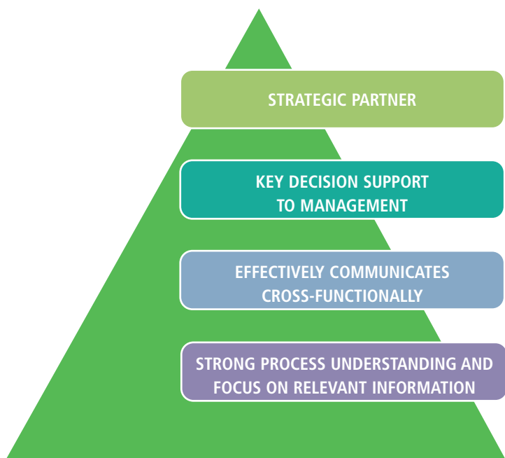
Figure 1: Implications for the Role of Today's Management Accountant